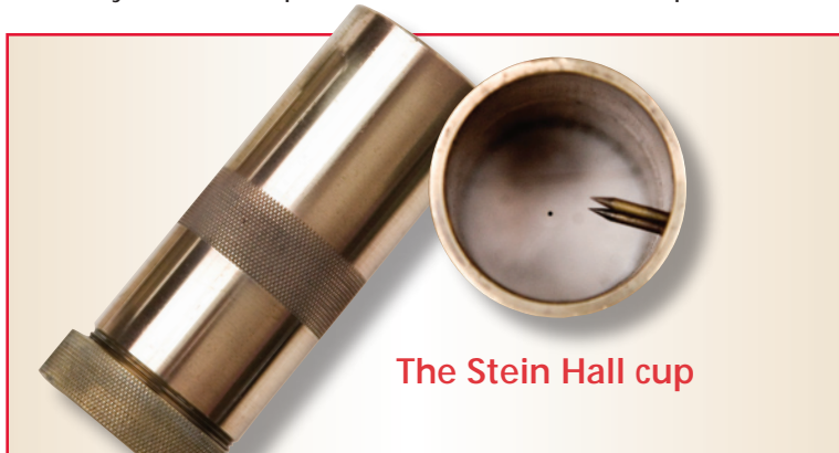
The Stein Hall cup

The Stein Hall cup should be preheated with the adhesive before the actual test is performed. It has a wall thickness of 3/16" solid brass that, if colder than the adhesive to be tested, will cool off the sample before the test is complete. This will give an inaccurate measurement. When filling the Stein Hall cup with adhesive, the adhesive should be strained through a kitchen strainer to remove any debris that could plug up the 1/10" hole the adhesive must pass through. The operator will measure the time the adhesive takes to drain out of the cup, starting at the top pin in the cup, and ending at the bottom pin. The resulting measurement should be recorded as seconds Stein Hall.