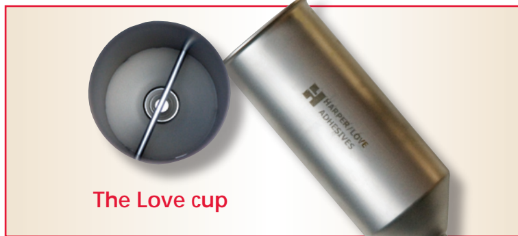
The Love cup

There are two acceptable methods to measure the starch adhesive viscosity in a box plant: the Love cup or the Stein Hall cup. Both cups measure the adhesive flow through an orifice over time.