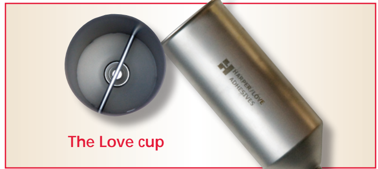
The Love cup

There are two acceptable methods to measure the starch adhesive viscosity in a box plant: the Love cup or the Stein Hall cup. Both cups measure the adhesive flow through an orifice over time.