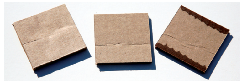
The failure of ECT samples is often accompanied by interflute buckling (above, left). This defect is similar to the patterned buckling of the liner board facings, which occurs during the compression test.

ECT measures the ability of a small vertically placed sample of combined board to sustain a top-to-bottom load. ECT is the single most important property in predicting box compression and the test helps to validate the quality of the raw materials.