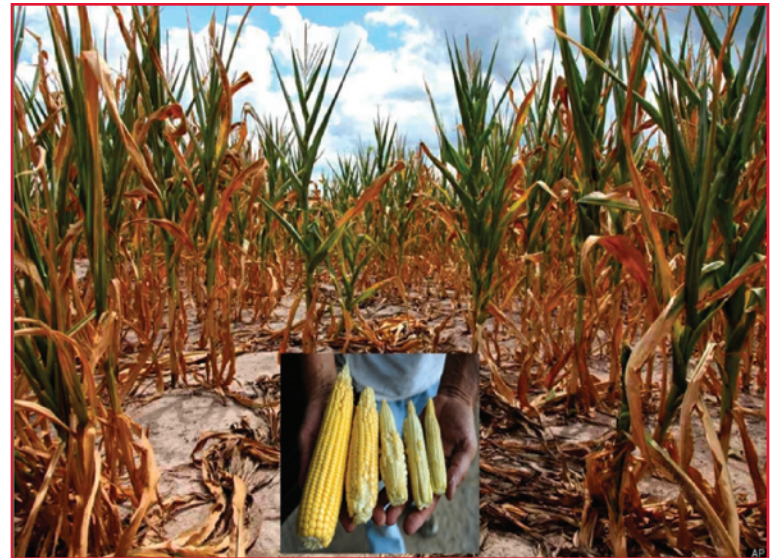
The impact of the drought is amplified by the Renewable Fuel Standard (RFS) mandate which provides that biofuels such as ethanol produced from corn must be used in the national transportation fuel supply.

The impact of the drought is amplified by the Renewable Fuel Standard (RFS) mandate which provides that biofuels such as ethanol produced from corn must be used in the national transportation fuel supply. This was passed by Congress in 2005 and greatly expanded in 2007 so that use now consumes almost 40 percent of the corn crop annually. The wicked combination this year of Mother Nature coupled with the RFS mandate is playing havoc with the price of corn futures.